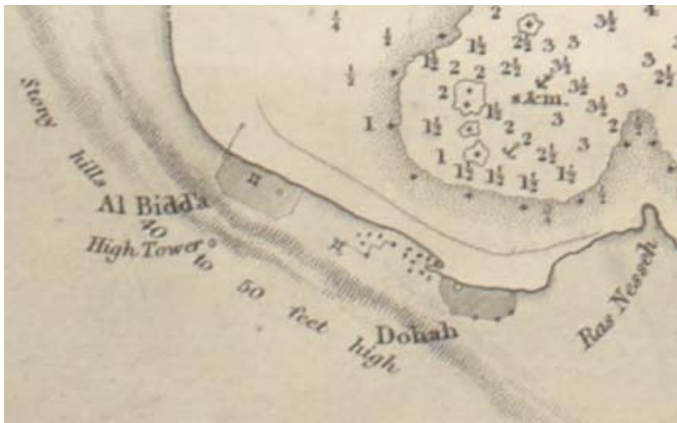
Constable and Stiffe's map of Doha and Bidda

The Persian Gulf Pilot, First Edition, 1879. Archive Editions.