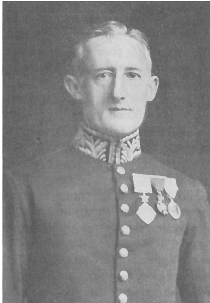
Photograph of Major Percy Cox, Political Resident