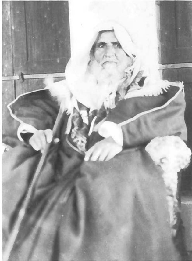
Photograph of Sheikh Jassim bin Mohammed al-Thani