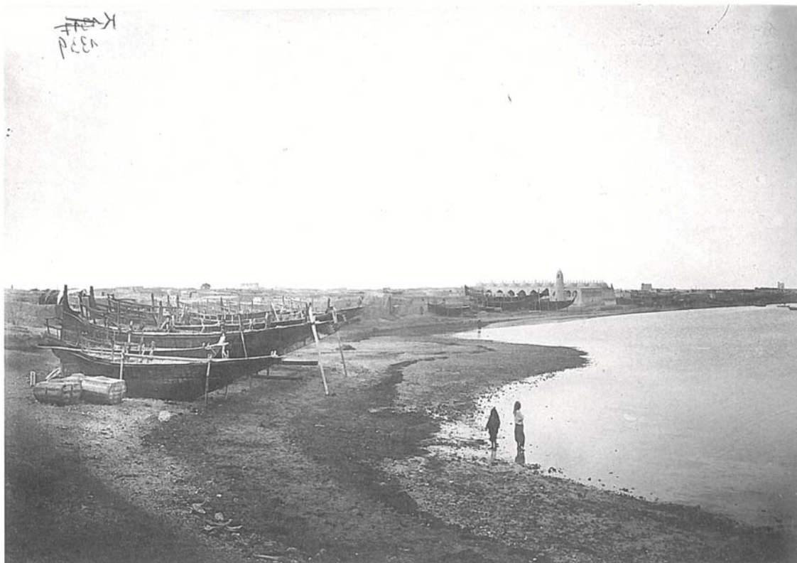
28 January 1904