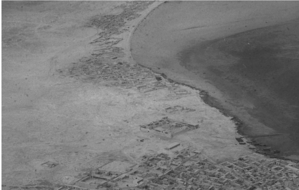
Aerial view in 1947 showing Bidda in the background, Doha in the foreground, and the Amiri Diwan in-between

Adham, K. (2011) 'Rediscovering the Island: Doha's Urbanity from Pearls to spectacle' in Elsheshtawy, Y (ed) The Evolving Arab city . London: Routledge