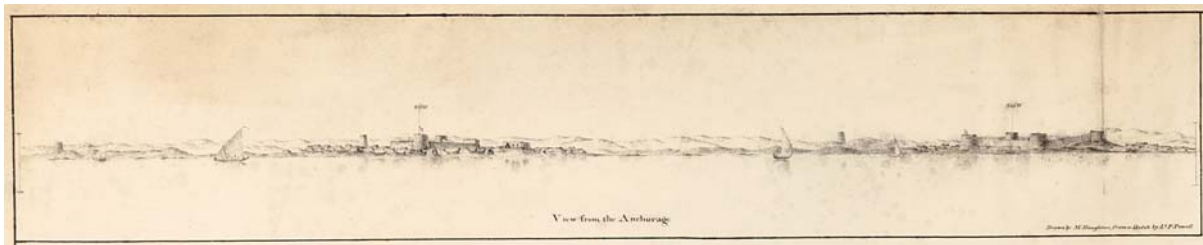
Panoramic view of Doha and Bidda in 1823

Brucks, G.B. (1829) Memoir descriptive of the Navigation of the Gulf of Persia in R.H. Thomas (ed) Selections from the records of the Bombay Government No XXIV (1985) New York: Oleander press.